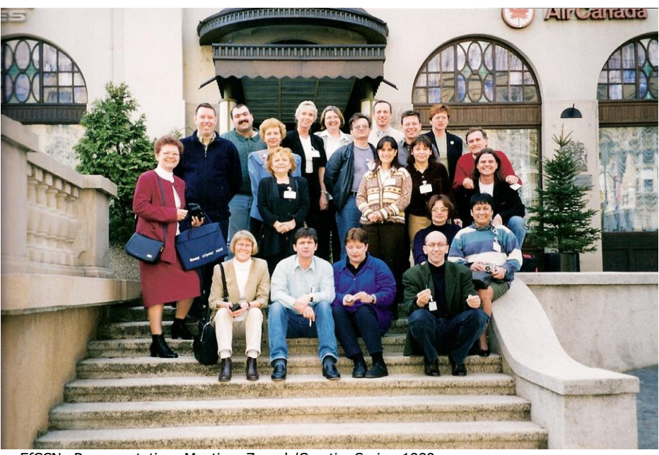
EfCCNa Representatives Meeting, Zagreb/Croatia, Spring 1999